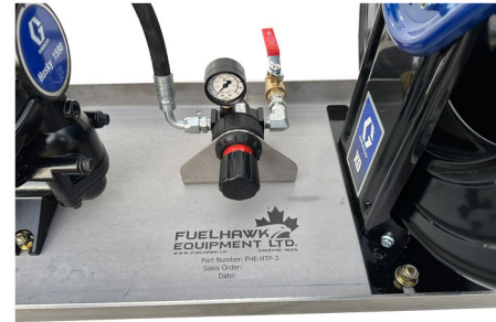
Easy to Access Regulator