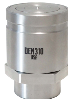
DEN310 DEF Nozzle 1-1/2"