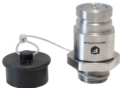
DER220 DEF Receiver

Fast Fill offers a wide variety of couplings for DEF products. All couplings are manufactured with high quality materials for your industrial use DEF applications.