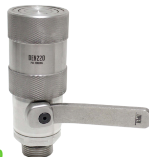
DEN220 DEF Nozzle