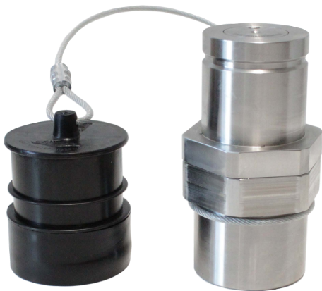
DER310 DEF Receiver 1-1/2"